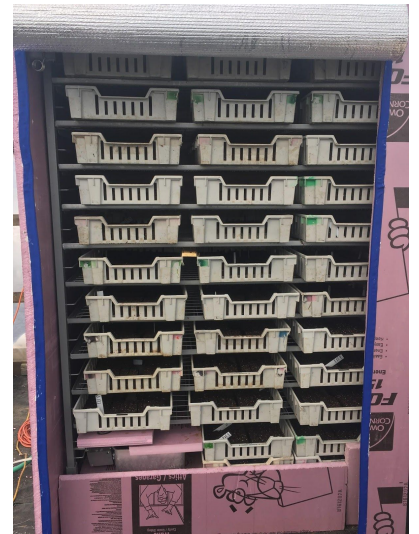
Photos 9-11: Germination Chamber - heat provided by hot water heater element wired into waterproof thermostat inside chamber - chamber can germinate 4080 plants at one time!