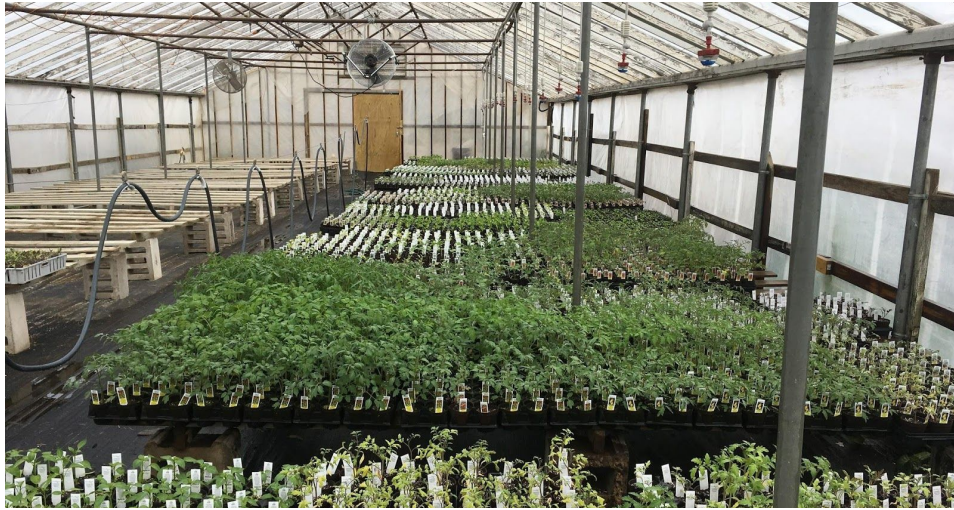
Photo 5: 5/2/17 - Thousands of plants ready for gardeners and our annual plant sale fundraiser.