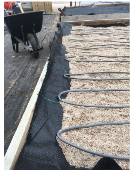
Photos 6-8: Heated Prop table - the cable is covered with sand and plugged into a thermostat.